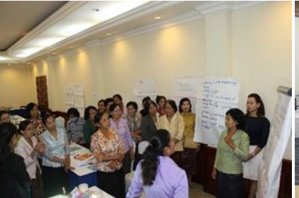
Group of female discussion on the critical issues liable to be raised at council meetings at female councilors workshop in Siem Reap