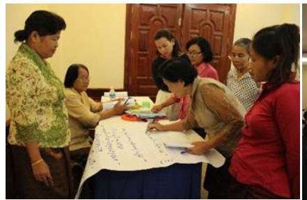
A group of female councilors discussion on summarizing skills at female councilors workshop in Siem Reap